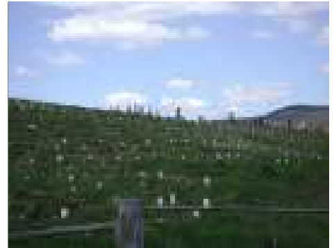
Students in Action at Lake Wallace.