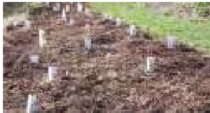
Work undertaken by the Outdoor Recreation Students

The Students have been involved in a 10 day out door recreation program undertaking a range of activities including kayaking, camping and white water rafting. The environmental activities give the students an opportunity to understand and become more aware of their environment and to assist in reducing their carbon footprint of their 10 day activities.