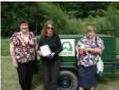
Members of the Vale of Clywdd Landcare group receiving their Sony Camera.

The Landcare group has also been successful in lobbying Lithgow council to provide new play equipment for the park adjacent to the creek where they have been working. Due to the work that the group has been undertaking the park is a much more pleasant place.