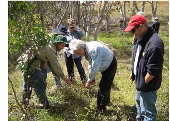
Tarago group busy seed collecting