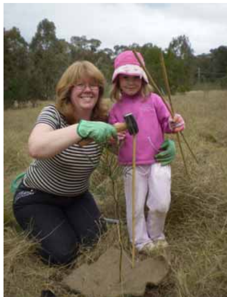
Above: Jumping joeys planting at Gow Park last September

These plants have been established in a grassy area, flat and safe, to enable the children to help out. As the plants grow they will help to connect two bushland areas in the Mulgoa Valley and add to the great work of the Mulgoa Landcare Group.