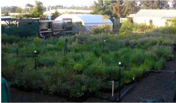
Wollondilly Community Nursery

Join the members of the Southwest Cumberlandcarers network and other landholders from around the Camden and Wollondilly area for the first network workshop of 2007. Come and learn how to propagate local native plants, identify and store seed.