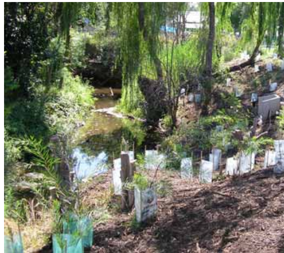
Redbank Group's site behind the Leisure Centre (above) and swimming pool site (below left)